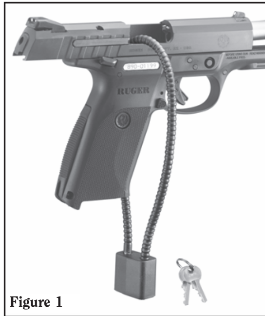
Correct Installation of Cable Lock For Ruger® SR-Series & 9E™ Pistols